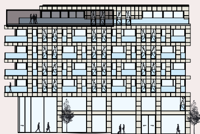
Rue de l'Alzette / Facade avant